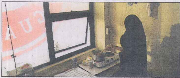
The steam of a meal is trapped in a flat because the window cannot be properly opened.