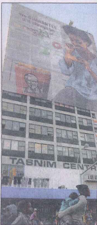
The outside of Tasnim Centre in the Durban CBD with the wraparound banner.

unhappy as the material used is mesh, which allows light and air to flow through... we have never asked the tenants to not open windows. We also feel they should have raised any concerns with us or the landlord. We could have addressed these issues."