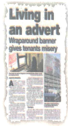
How the Daily News covered the story on Friday.