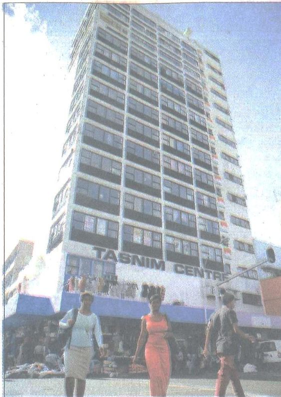
The face of Tasnim Centre after the wrap-around KFC advert was taken off the building.

"They're suffocating us. They are making money at our expense and they can't even fix the lift for more than a year,"