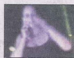
A screen grab of the video.

"I said I don't want to deal with any k***** and I'm not prepared to deal with any k*****, I've just