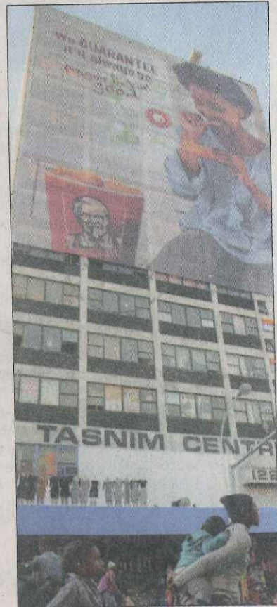
The outside of Tasnim Centre in the Durban CBD with the wraparound banner.

unhappy as the material used is mesh, which allows light and air to flow through... we have never asked the tenants to not open windows. We also feel they should have raised any concerns with us or the landlord. We could have addressed these issues."